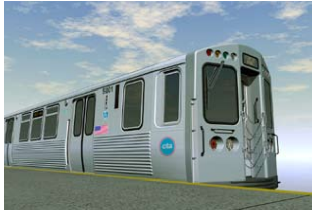
Chicago trains will be equipped with Bombardier's Ethernet network

"We have a project where the TCN will be kept only for local connections whereas the train-wide communication will be carried out on the ETB (Ethernet Backbone). They will start commissioning after the summer. This is the next step on the way to the full Ethernet train. The network carries all data types needed for control, security and passenger information e.g. data from surveillance cameras, passenger announcements, data to control the operation of the train and coaches (doors, propulsion, lighting...). All except signalling and Internet access will be managed through the Ethernet protocol." Says Klas ENGLUND, TCMS Product Manager at Bombardier Transportation Sweden.